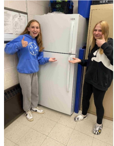
New fridges for schools