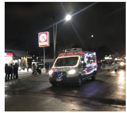
FSP van in Santa parade

FSP named Charity of Choice for MacKinnon Bros. Back to the Farm music, beer and food festival in August 2023.