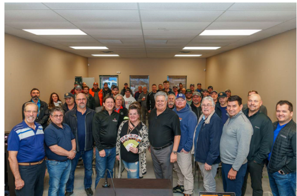
LiUNA local 183

...and to the many more donors who helped us get food to kids at school this year!