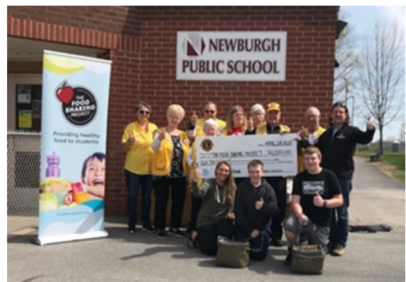
Newburgh Camden Lions Club

...and to the many more donors who helped us get food to kids at school this year!