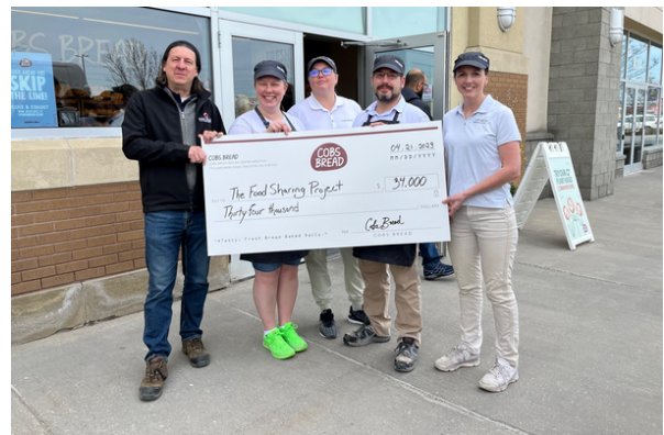
COBS BREAD Riocan Kingston

Implant Recycling / James Reid Funeral Home